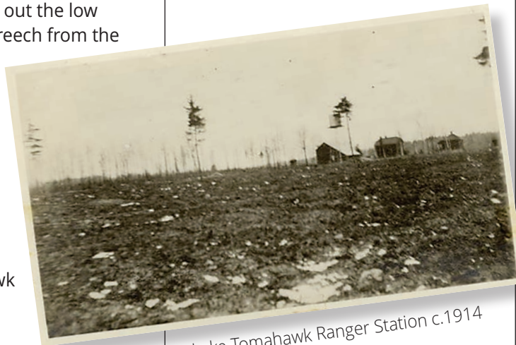
Lake Tomahawk Ranger Station c.1914